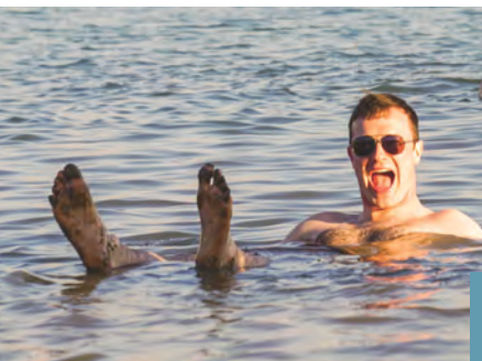
FLOAT IN THE DEAD SEA, THE LOWEST POINT ON EARTH.