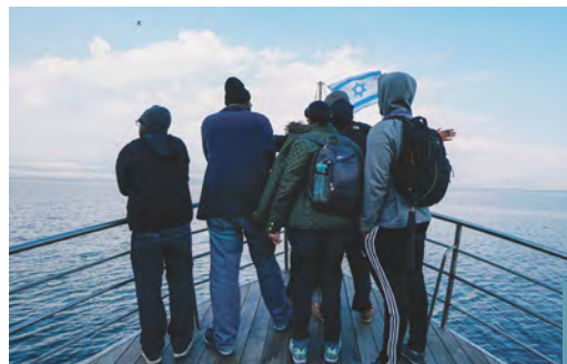
EXPLORING THE SEA OF GALILEE AND JESUS' MINISTRY SITES.