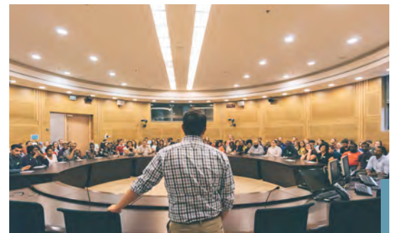
TOUR INSIDE THE KNESSET, ISRAEL'S PARLIAMENT BUILDING.