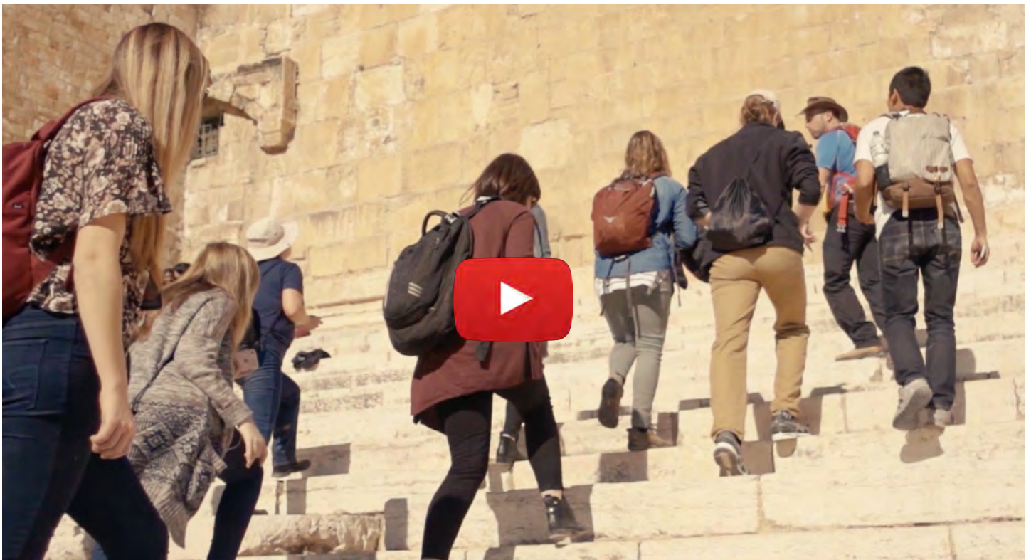
WATCH OUR PASSAGES TRAILER