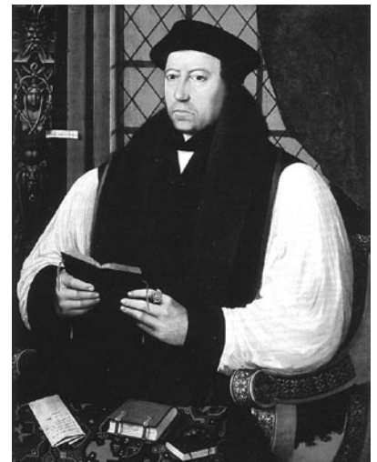
Thomas Cranmer, Archbishop of Canterbury 1533-1556

Thirdly, Cranmer wrote a series of sermons in English which explained key Christian truths from the Scriptures and the fathers of the early church. The first sermon in the series was "A Fruitful Exhortation to the reading and knowledge of the holy Scripture." Here again Cranmer encouraged the individual, daily reading of Scripture and explained the transforming power reading the Bible regularly would have in the Christian's life. He also explained the importance of prayer and the work of the Holy Spirit in making the Scripture understandable to the reader.