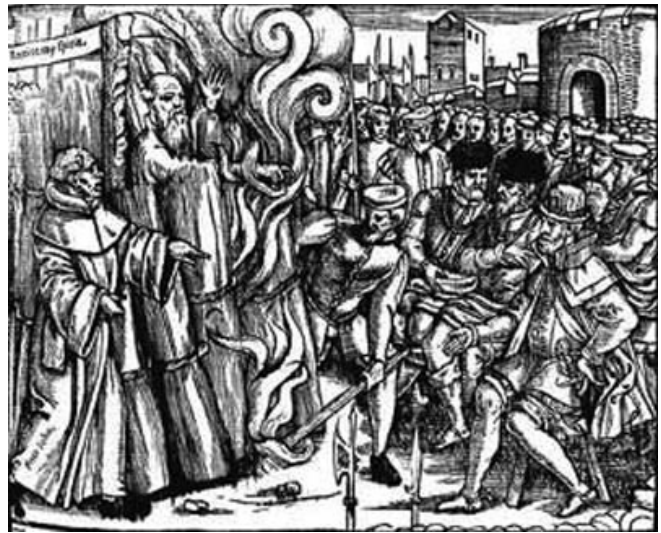
Cranmer's burning at the stake, as shown in Foxe's Book of Martyrs .

First, he encouraged the 1539 publication of the English Bible, which, because of its size, became known as the Great Bible , a copy of which was required to be placed in every church in England. Cranmer's Preface to the Great Bible encouraged the individual's personal, daily reading of the Scripture. He quoted extensively from the fourth century church father John Chrysostom to show that reading of the Bible by the individual Christian was a practice encouraged in the early church.