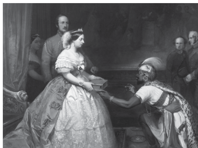
Queen Victoria once said that the Bible was the secret of England's greatness, and as the British Empire expanded, it carried the English Bible around the globe. "The Secret of England's Greatness" by Thomas Jones Barker, 1863, shows Queen Victoria presenting a Bible to an African chieftain.

In 1604, shortly after King James I became King of England, a conference of theologians and Church leaders met with the King at Hampton Court Palace. At the Hampton Court Conference Puritans presented their hope that "the present state of the Church may be further reformed in all things needful, according to the rule of God's holy word." King