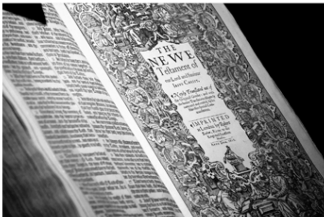
1st edition of the 1611 King James Bible in the Dunham Bible Museum.

The first edition of the King James Bible was a large folio edition, with pages 11.5 x 17.5 inches, designed to be used as a pulpit Bible in the churches of England. The linen and rag paper has survived the centuries well. It is unknown how many initial copies were printed by Robert Barker, the King's licensed printer, but Brake and Hellstern estimate 1,500-2,000 copies comprised the first edition. This seems especially likely since another folio edition needed to be printed as early as 1613. Barker printed five folio editions – 1611, 1613, 1634, and 1639/40. The leaves were identical, word for word, allowing leaves remaining from one printing to be used with leaves from a different printing.