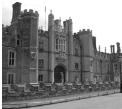
King James' decision to authorize a new English translation of the Bible was made at a Conference at Hampton Court in 1604.

James was not sympathetic to the Puritans' requests, except when Puritan John Reynolds suggested a new English translation of the Bible was needed. King James thoroughly approved and commissioned a new English translation of the Bible.