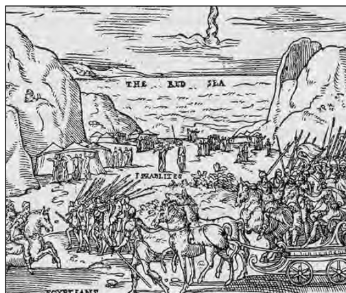
Illustration on title page of Geneva Bible is of Israel's deliverance from Pharaoh at the Red Sea.

The scene and Scriptures symbolized the longings of the English exiles in Geneva – a longing to return to their own land and be free from the oppression of a tyrannical ruler.