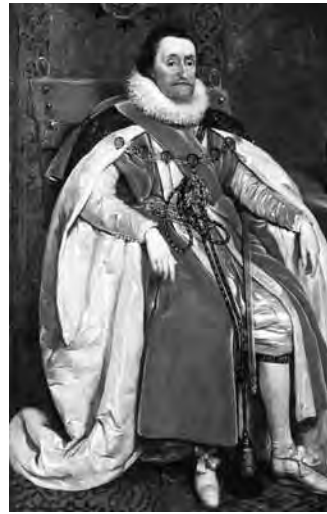
King James VI of Scotland (later King James I of England) authorized printing of Geneva Bible in Scotland, but came to despise its notes as being against the divine right of kings.

The Geneva Bible had a tremendous influence on Christians in Scotland. Scotland's King James VI (later King James I of England) authorized the Geneva Version as the first Bible to be printed in Scotland. The King also authorized at least one copy be kept in every church in Scotland. The Scottish parliament went further and required every “householder worth 300 marks of yearly rent and all yeoman and burgesses worth 500 pounds in lands and goods” to have a Bible and psalm book in the common language. A fine of £10 was assessed for non-compliance. King James, however, came to despise the Geneva Bible because of its anti-monarchical notes – but that's another story.