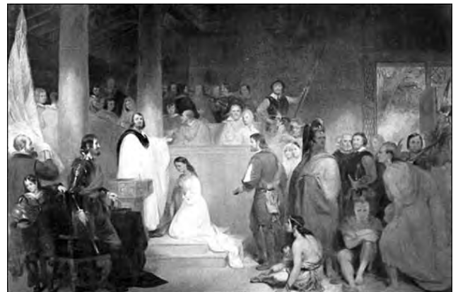
Pocahontas, John Rolfe, and early settlers at Jamestown read the Geneva Bible.

The Geneva Bible became very popular in England, going through over 140 editions in ensuing decades. With the widespread availability of the Geneva Bible, the Bible became the one book familiar to every Englishman. England became a people of a book - the Bible. The Bible was the literature of the people, molding their speech, shaping their language, permeating their thoughts, and changing the entire moral character of the nation. As the Bible was read and discussed, literacy and education grew among all classes of both men and women.