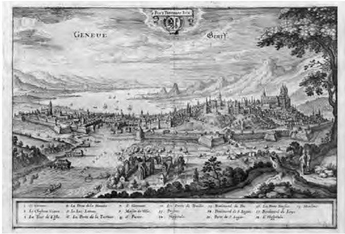
Geneva, with the Cathedral on the hill overlooking Lake Geneva, 17th century print.

The Genevan translators built upon a half a century of translation work and scholarly study of the biblical texts. They consulted not only the earlier English translations, but also recent translations into French, Italian, Spanish, and Latin, as well as scholarly editions of the Greek and Hebrew texts.