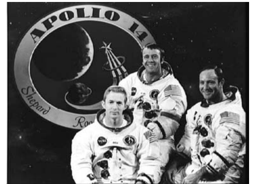
The Apollo 14 crew: Stuart Roosa, Alan Shepard and Edgar Mitchell.

John Glenn, the first American in space in 1962, was able to be part of a space shuttle flight 36 years later, in 1998. He then said, "To look at this kind of creation out here and not believe in God is to me impossible. It just strengthens my faith." Even though he never was in space, three thousand years earlier, David wrote in Psalm 19, "The heavens declare the glory of God, and the firmament shows his handy work."